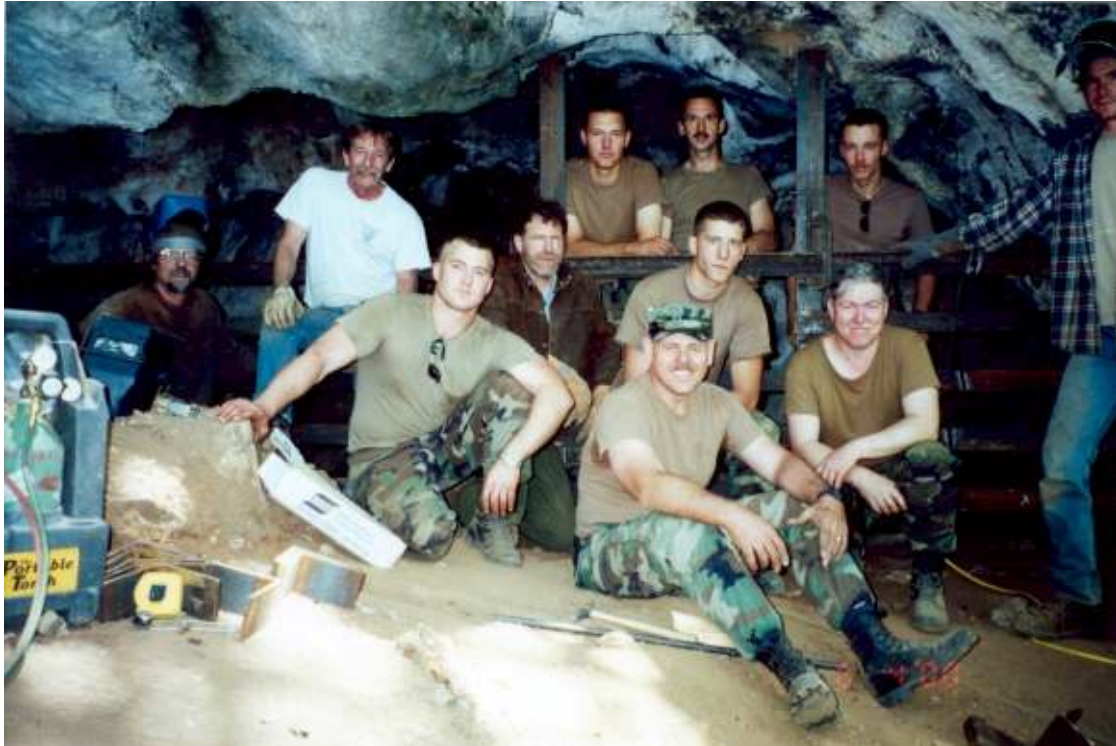
Part of the No Name gate crew, includes National Guardsmen.