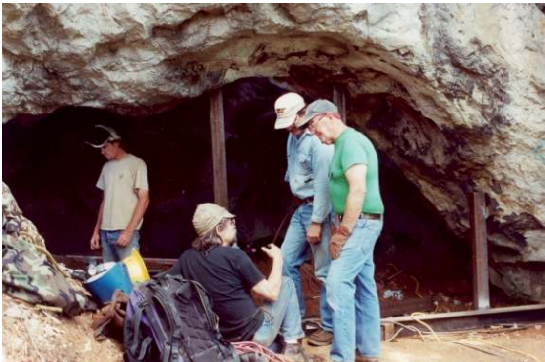
Cavers compare notes at entrance to No Name Cave.