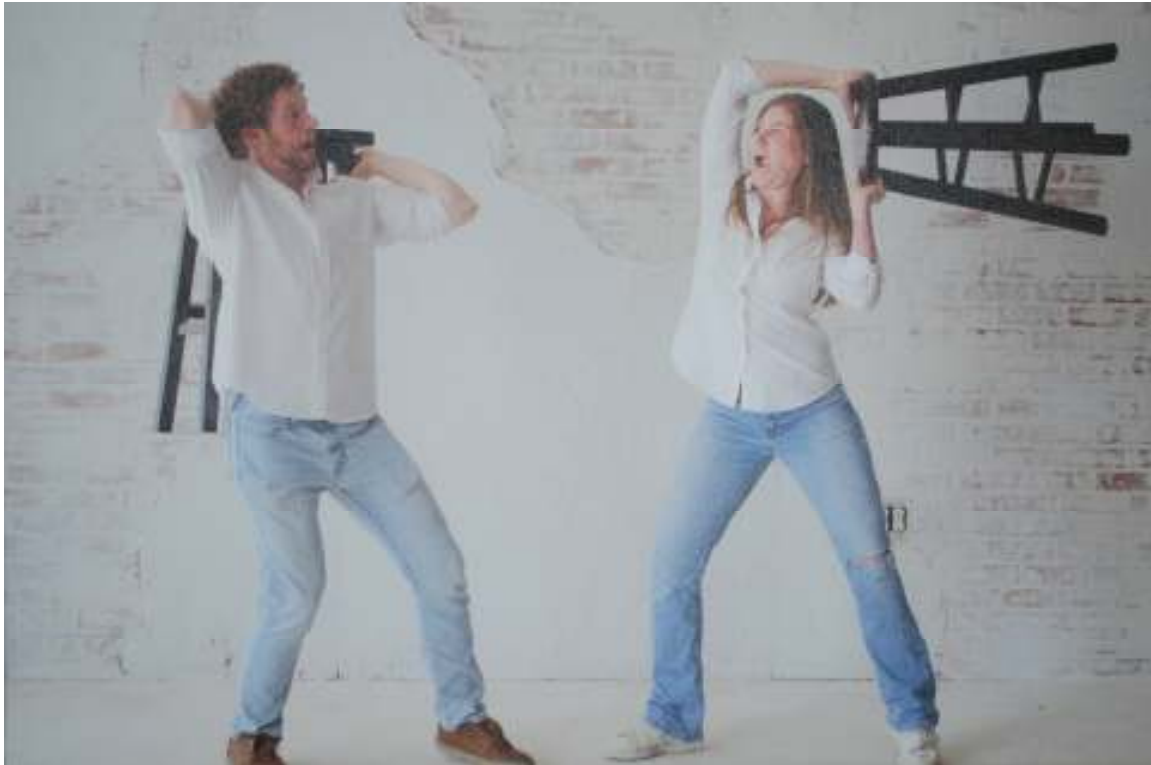
New Caver Rule 4: Caves are not shared.

SAG RAG 321 Mesa Verde Ct Chico CA 95973