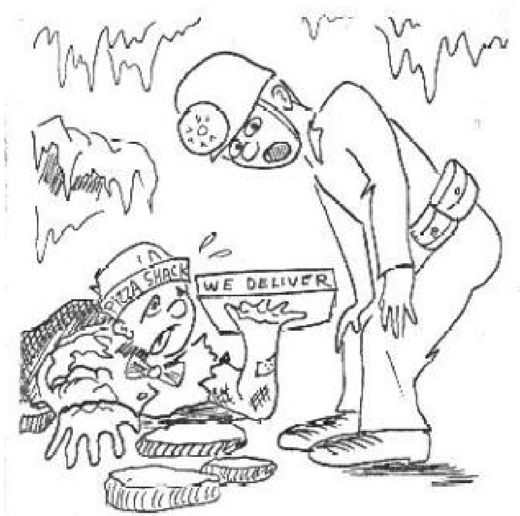
Cartoon by Kerry Brown

When you just can't wait to get some food after a day of caving and know you aren't able to make it to Floyd's in time!