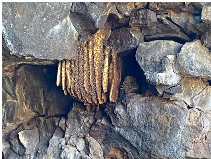
Our friend the beehive.