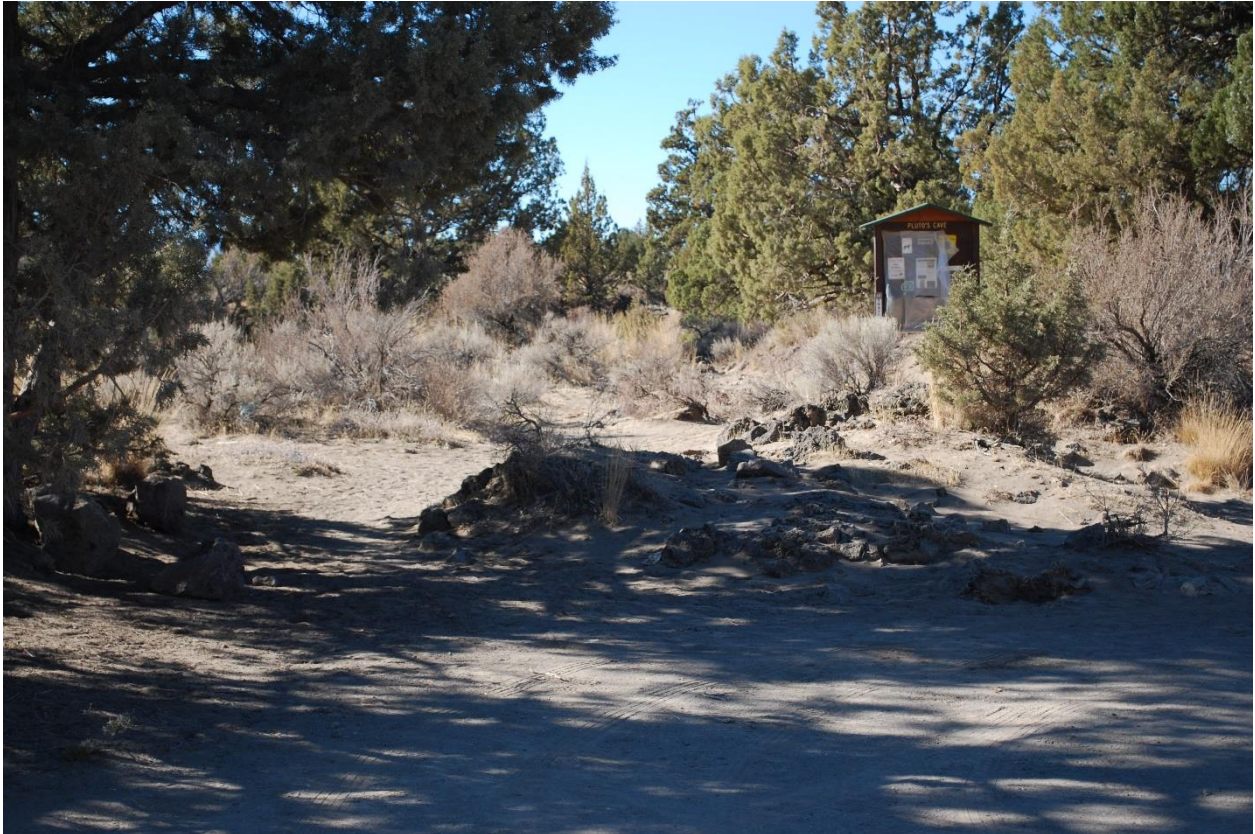
Pluto's Cave Trailhead