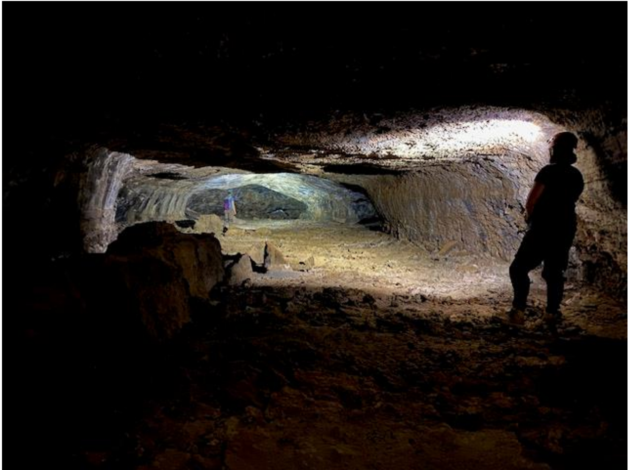
CJM and Katrina in a cool shot!